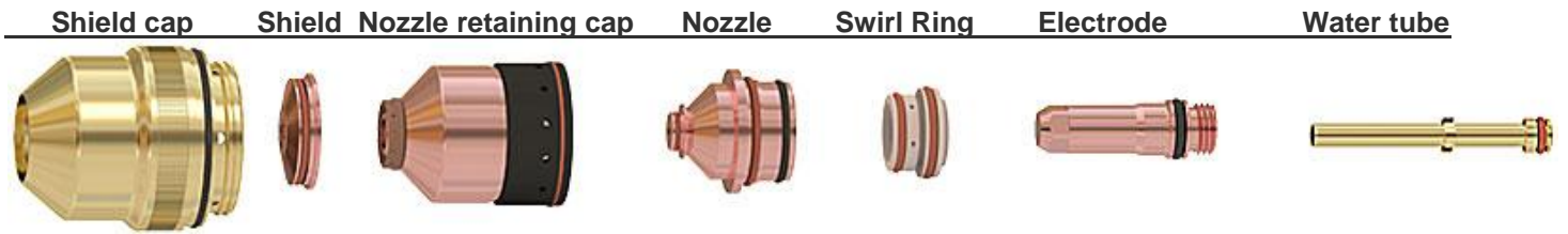
130 amp consumables - aluminum